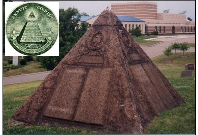
Satanic (all-seeing eye of Horus) memorial placed near Russell's grave site at the Rosemont United Cemetery in Philadelphia, PA.