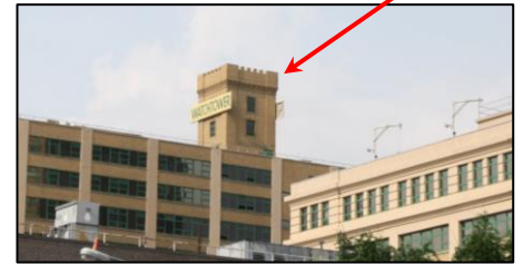
Watchtower Publishing Facility