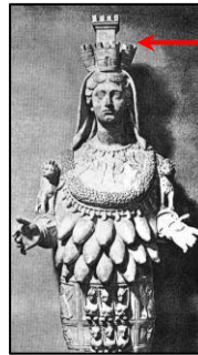
"Watchtower" on head of Greek goddess Artemis.