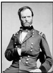
General William Sherman

Demons, Fallen Angels, Principalities, Powers of Darkness, Dominions