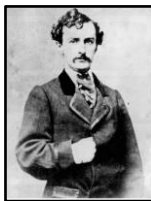
John Wilkes Booth