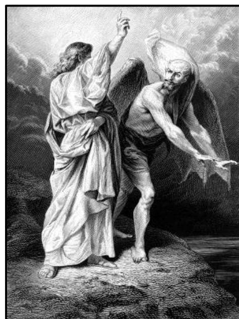
Depiction of Satan Tempting Jesus in the Wilderness