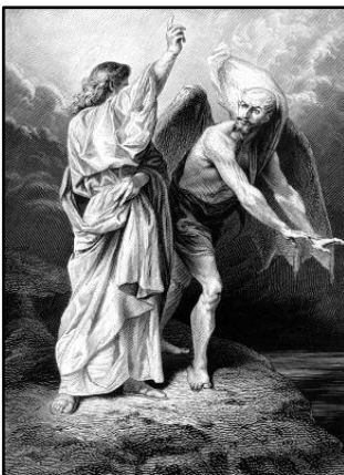
Depiction of Satan Tempting Jesus in the Wilderness