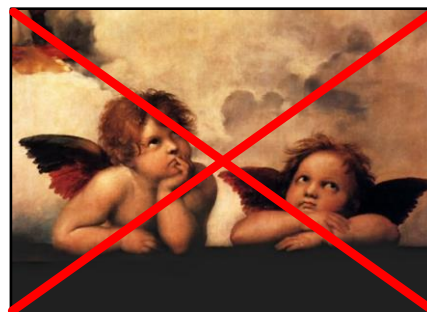
Angels are always adult males. There are no baby or female angels.