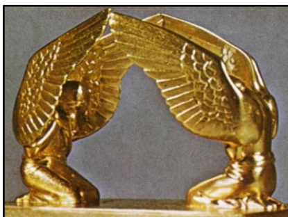
Model of Cherubim over Mercy Seat