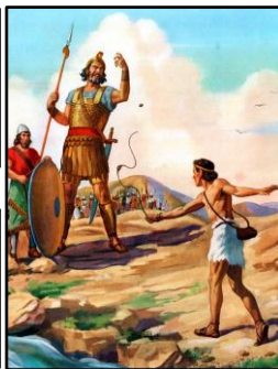
David Fighting Goliath the Giant →